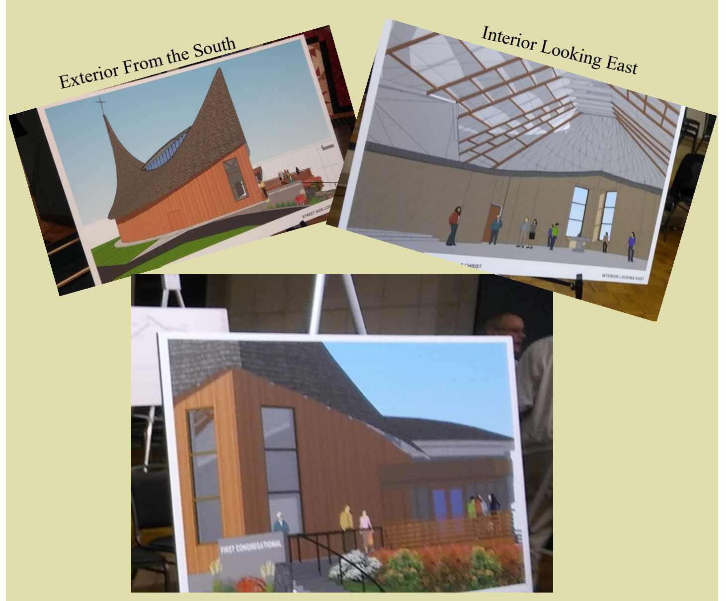
New Entrance on East Side

We are learning that "Patience is a Virtue". ~ Ken Rowe