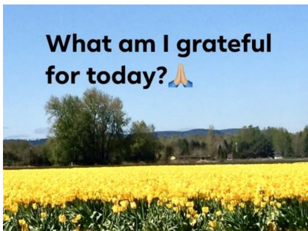
Holland Bulb Farm tulip fields, in Woodland, a place of great joy for me.

Our whole lives are changing. Many of us look for ways to stay positive while physically distancing ourselves from friends and family. Many as well struggle to adapt their work and family interactions while schools/businesses are closed but they are still working, with some struggling to keep the rest of us safe.