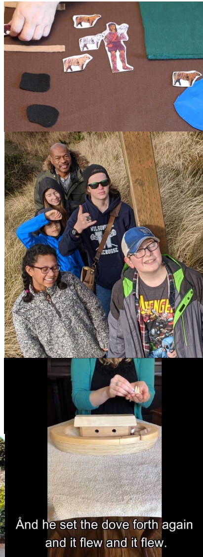
And he set the dove forth again and it flew and it flew.

“It is the mission of our church to follow Christ in faith and lead the community by example.